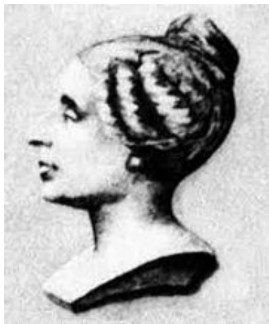
Mathematician, physicist, and philosopher - Marie-Sophie Germain, born April 01, 1776 A prime number p is a Sophie Germain prime if 2p + 1 is also prime, eg. \{2, 3, 5\}